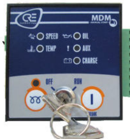
MDM MODULE FRONT FACE KEYSWITCH