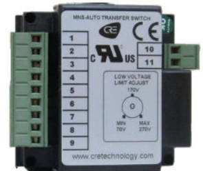
MNS MODULE REAR FACE