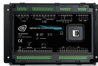
GENSYS COMPACT MAINS CORE BASE MOUNTED VERSION

The GENSYS COMPACT MAINS CORE is used on standalone genset in mains paralleling application. GENSYS COMPACT MAINS CORE range offers flexibility and time saving thanks to its simple wiring, all features included (no option), and easy engineering & programming.