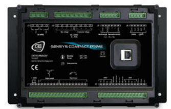
GENSYS COMPACT PRIME CORE BASE MOUNTED VERSION