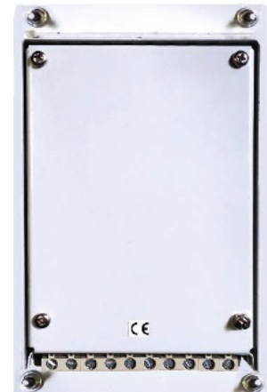
C2S MODULE REAR VIEW